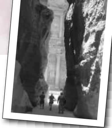
Visitors walk or ride camels through a gorge to get to Petra.