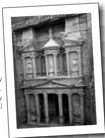
The Treasury at Petra.

The Museum of Egyptian Antiquities is a must see. It has over 130,000 exhibits including Pharaonic and Byzantine art and sculpture, the Mummy Room and the Tutankhamun exhibition. The River Nile is a relaxing way to observe life in Egypt.